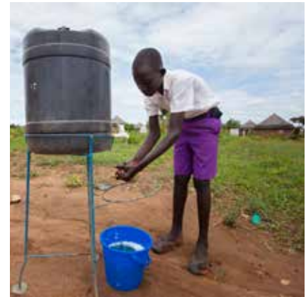
A boy practices what he learned about handwashing from his WASH club.

In Kamwokya, a neighbourhood of Kampala, inadequate sanitation facilities and a lack of hygiene knowledge leave many community members vulnerable to infectious diseases. WASH clubs use games to teach children about good hygiene practices and disease prevention. When COVID-19 hit, youth leaders from WASH clubs sprang into action, using radio and community awareness campaigns to empower more than a thousand children and adults with information about proper handwashing technique and how to protect themselves from COVID-19 and other diseases.