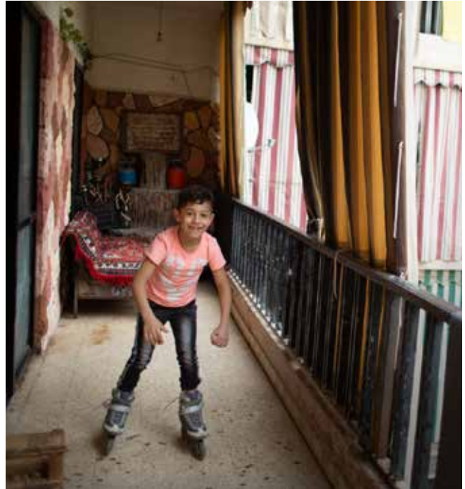
A young boy plays on his balcony to stay active.

At the start of quarantine, Right To Play collaborated with the Jordanian Ministry of Education to create a series of physical activity videos to help children cope with stress and boredom, stay physically active, and develop a positive relationship with their bodies. The videos were broadcast on Jordan's academic television channels, reaching more than 1.4 million children in grades 1 to 12 each week. Since then, we've started working with a group of NGOs to create videos that support learning in subjects such as science, English, Arabic, and mathematics for children in grades 1 to 10.